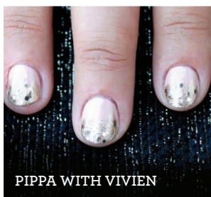
PIPPA WITH VIVIEN

Prep nails and apply two coats of Amy (make sure to seal the free edge*). Lightly swipe Carly halfway up your nail from the base of nail towards the tip. Apply second coat of Carly to base of nail. Apply a topcoat for shine and durability.