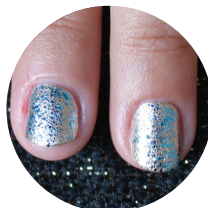
CARLY + SIENNA