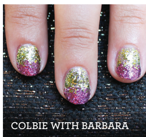
COLBIE WITH BARBARA

Prep nails and apply two coats of Pippa (make sure to seal the free edge*). Lightly swipe Vivien halfway down nail from the tip of nail towards the base. Apply second coat of Vivien to tip of nail. Apply topcoat for shine and durability.