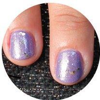
VIVIEN + ANNE