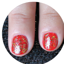
COLBIE + JANUARY